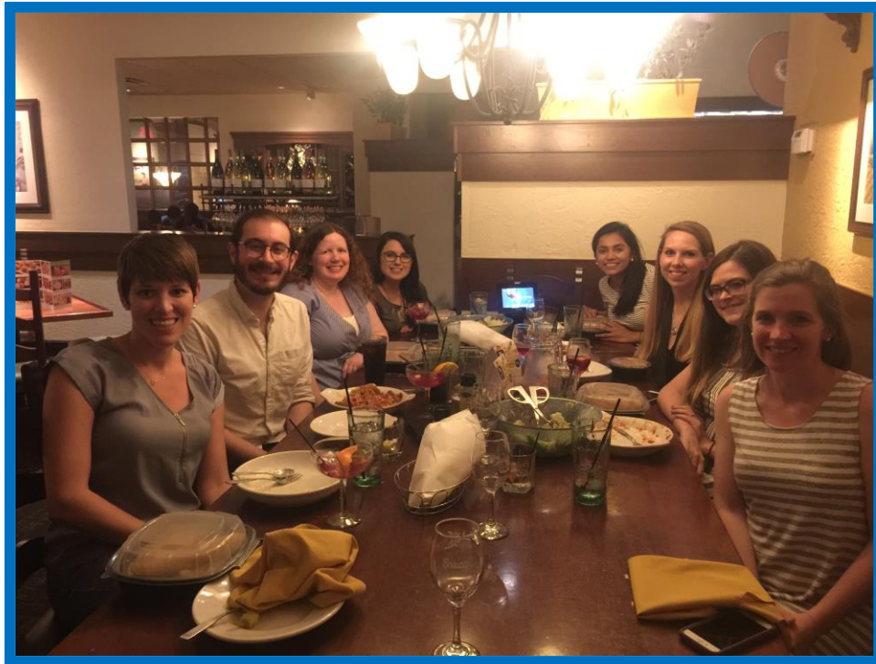
Residency Banquet 2018